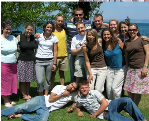
The team from CA and Montefiascone at Camp