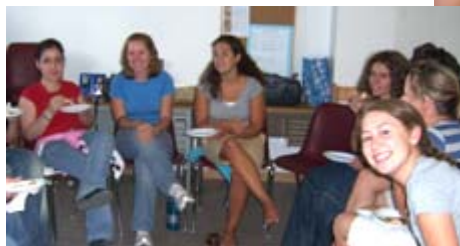
Enjoying pizza at the Pizza and Praise Nights

I am looking over songs with the Monterosi youth, who traveled an hour to help with and enjoy the fellowship of the Pizza and Praise Nights