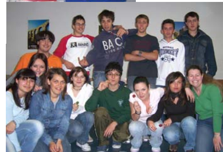
High School Conversational English class, June 2007