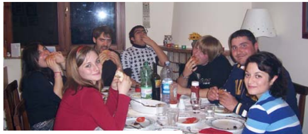
Enjoying burgers at my home with youth from the Monterosi church