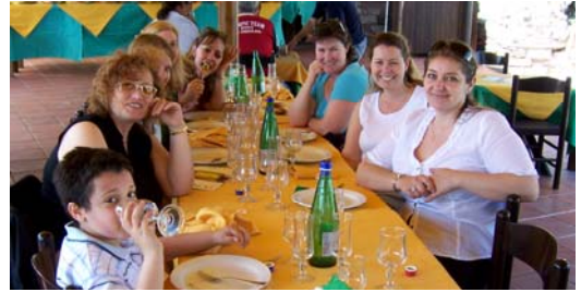
Lunch out with the women of the Montefiascone church