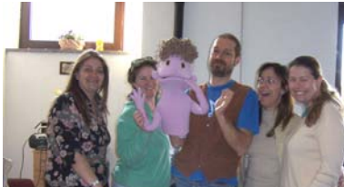
Member of the church spend time together making puppets for teaching and outreach events