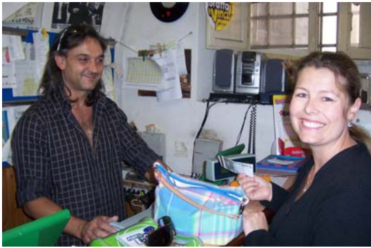
Tobacco store #1... This is where I go when I need stamps for letters, (I can't buy stamps at the post office).