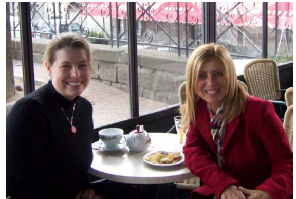
A great place to meet a friend for a cup of tea and conversation.

The best gift is something that we do not have to shop for. It has already been purchased for us at a great price. Sadly most Italians are preparing for the holiday, but not expecting to find the gift of Christ and the salvation He brings. Pray that I might boldly proclaim the Gospel. I will be praying that you will have a very merry Christmas celebrating God's gift to us...Christ's birth!