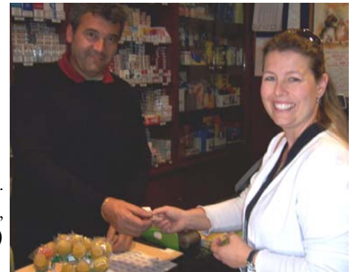
Tobacco store #2... This is where I go to buy my international phone card, (they do not have stamps for mailing to the USA)