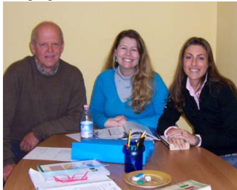
I continue to enjoy class every week