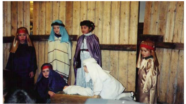
Kindergarten Christmas Pageant 2002