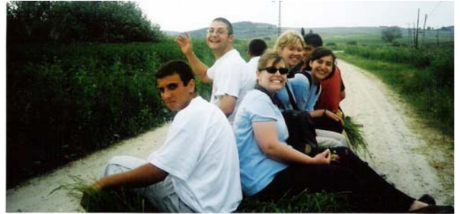
Youth and I travel by horse-drawn wagon to a village