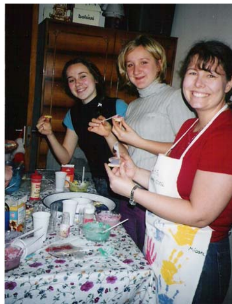
Decorating Christmas cookies with youth